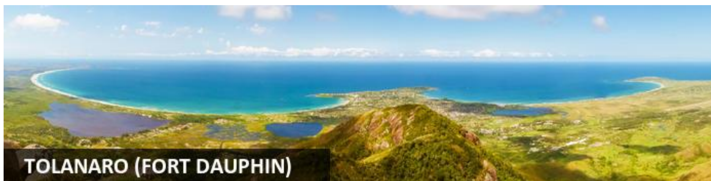
TOLANARO (FORT DAUPHIN)